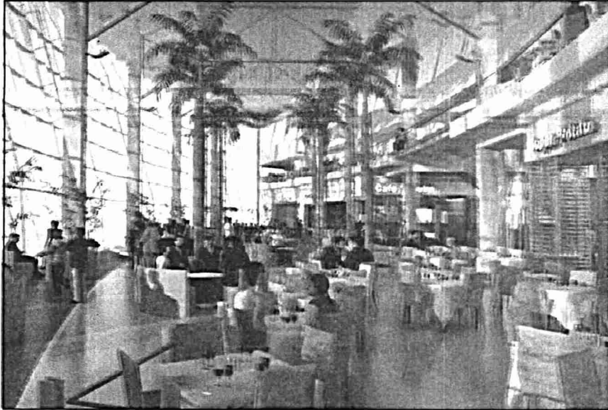
Lindbergh Field's Terminal 2 will offer six more security lines and an expanded concession area.