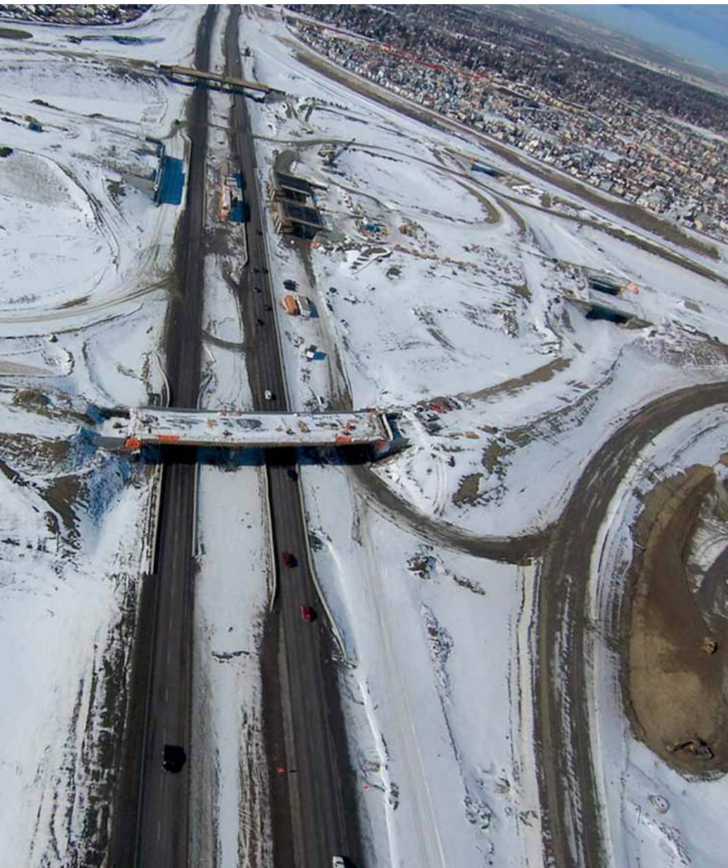
NORTHEAST STONEY TRAIL CALGARY, ALBERTA